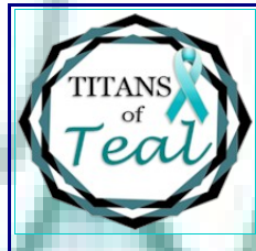
2011 Awareness Campaign

Our commitment to raise awareness to ovarian cancer continues 7 days a week, 52 weeks a year. We ask that you help us continue this tradition by telling us about your own events and experiences.