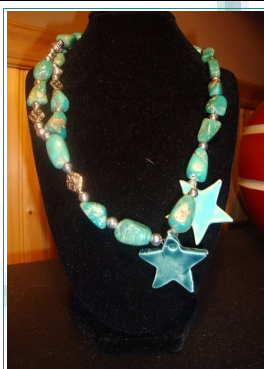
Beautiful Genuine Turquoise and hand sculpted teal stars - $75.00